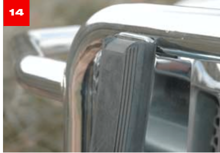
The heavy duty push pads are firmly attached and thick enough to absorb relentless abuse throughout the course of its lifetime.