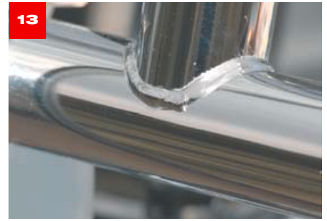
The Go Industries Big Tex grille features a two-inch diameter bar made from 14 gauge steel.