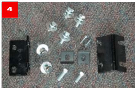
4 Should we decide to do so in the future, we would need to drill two small holes for the #8 3/4 inch self-tapping screws provided with the grille guard. We recommend using silicone on the screws to reseal the grille.