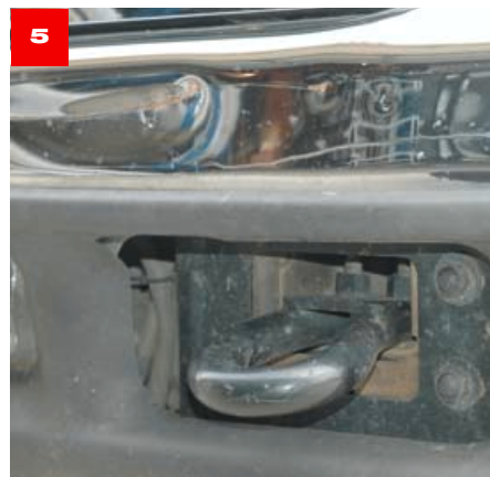
5 The two black bolts on each side of the bumper must be loosened just enough to slide the grille guard brackets into position beneath the bolts.

W hen push comes to shove, bigger is better. In many off-road situations, many vehicles often need a push to get out of a sticky situation. In this case, a truck with a good push bar will do the trick. But if you are looking for a real grille guard that doesn't wobble or is merely added on for looks, then you may want to check out the Go Industries Big Tex grille guard. Not only is the Big Tex grille guard larger than most other grille guards, it uses sturdy factory mounting points so that it is actually functional.