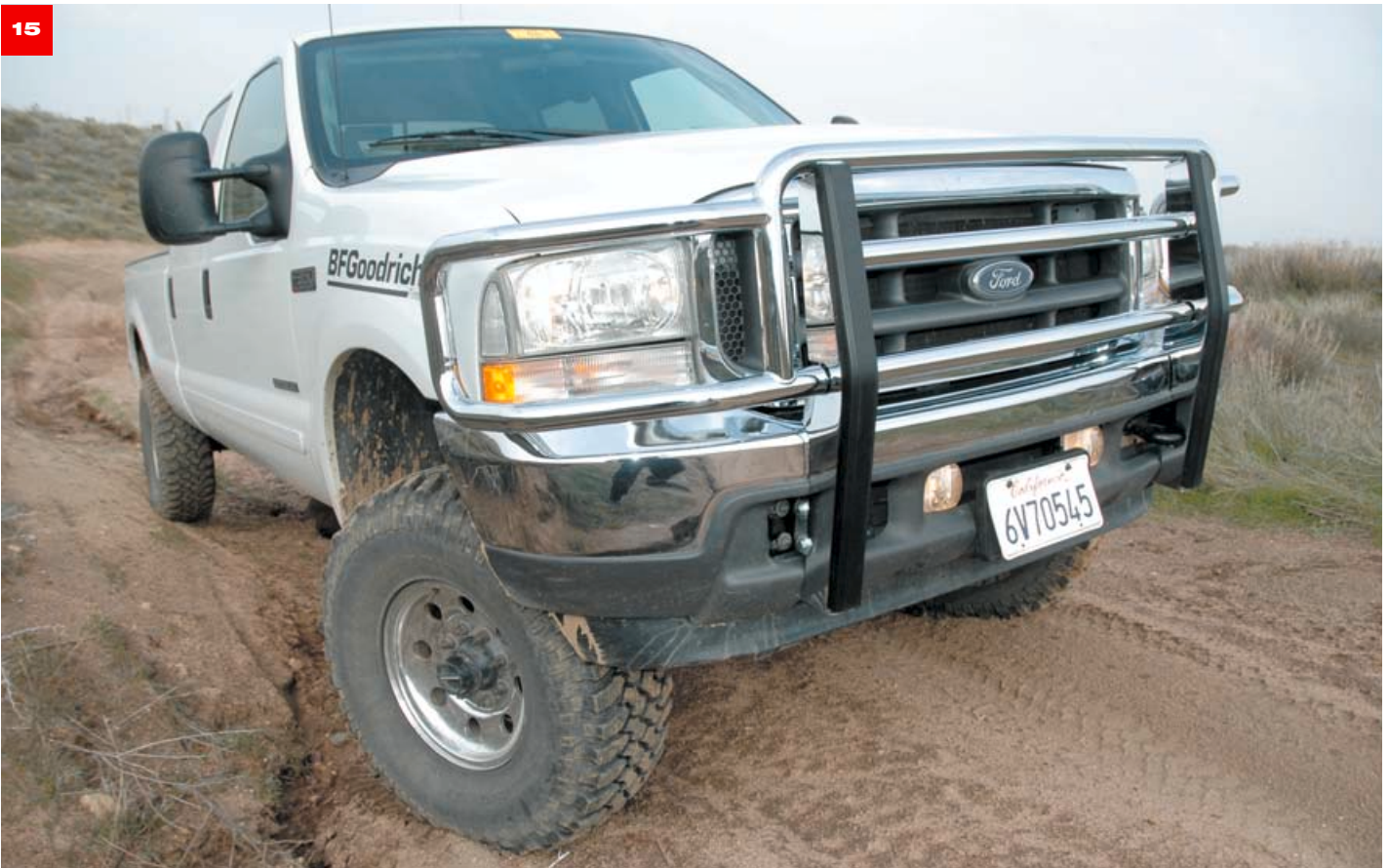
The Big Tex bar not only looks good, but it protects the front of this Ford Super Duty and provides a solid platform to lend aid to any stuck vehicle.