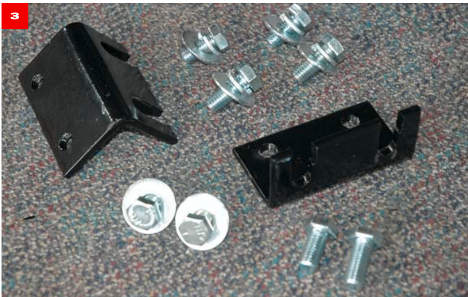
3 Further proving this install was easy, the hardware for the Big Tex Grille Guard consists of only a handful of pieces, which includes two auxiliary light tabs we opted not to install at this time.