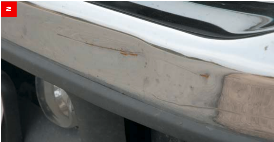
2 The damage seen here was received from a Jeep that was stuck on a Jeep trail in the rugged San Bernardino National Forest. The Super Duty easily shoved the Jeep to the side of the trail but suffered some damage in performing its good deed for the day.