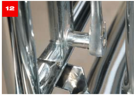
The cross bars are then bolted into position on the upright brackets. The cross bars come pre-assembled and simply bolt in at the rear.