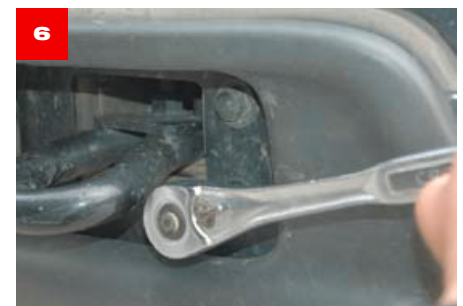
6 This is easy, since the nuts holding these bolts in place are fixed and do not require a wrench on the other end. Only loosen one side of the bumper at a time.

— By: Fidel Gonzales/ Dan Sanchez Photos: Fidel Gonzales