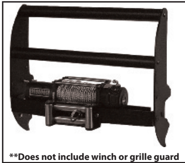
**Does not include winch or grille guard