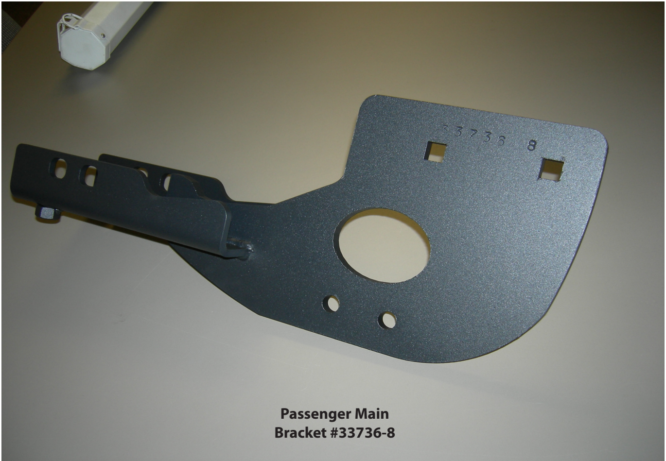
Passenger Main Bracket #33736-8